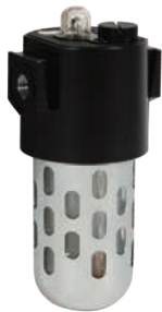
transparent bowl with guard