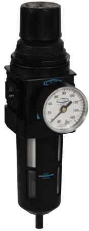
with transparent bowl